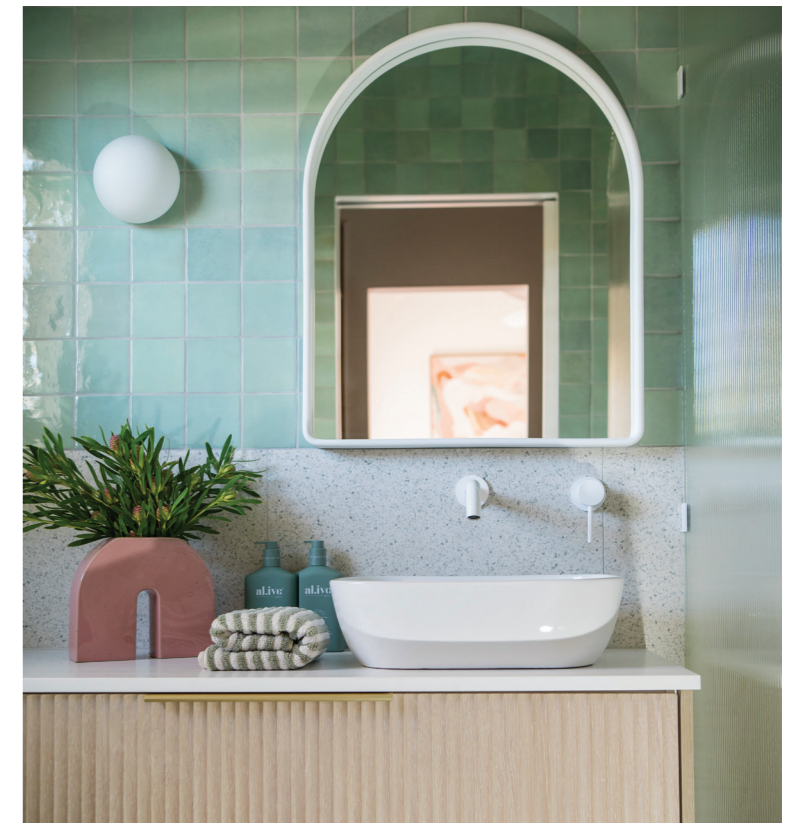
THIS PAGE - The internal colour palette is vibrant and sophisticated, reflecting post-war modernist design and the surrounding riverine landscape with an emphasis on neutrals and earthy tones.