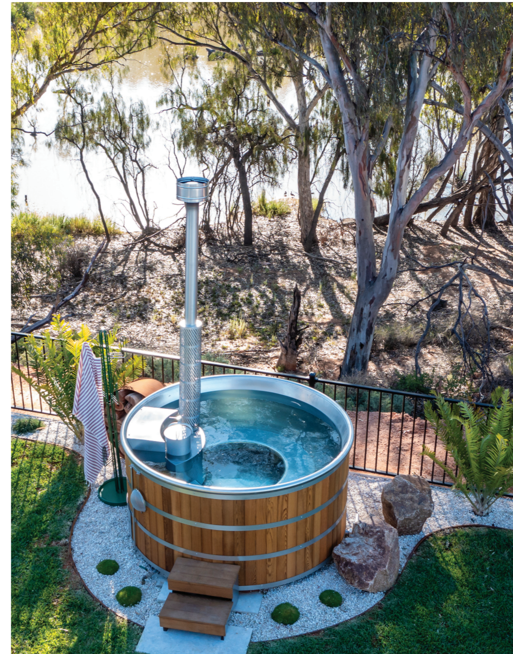
ABOVE - For those seeking the ultimate in indulgence, there is a wood-fired hot tub offered as an optional extra.

Large sliding doors are doubly useful. They allow plenty of light in and easy access to the L-shaped deck area that wraps around