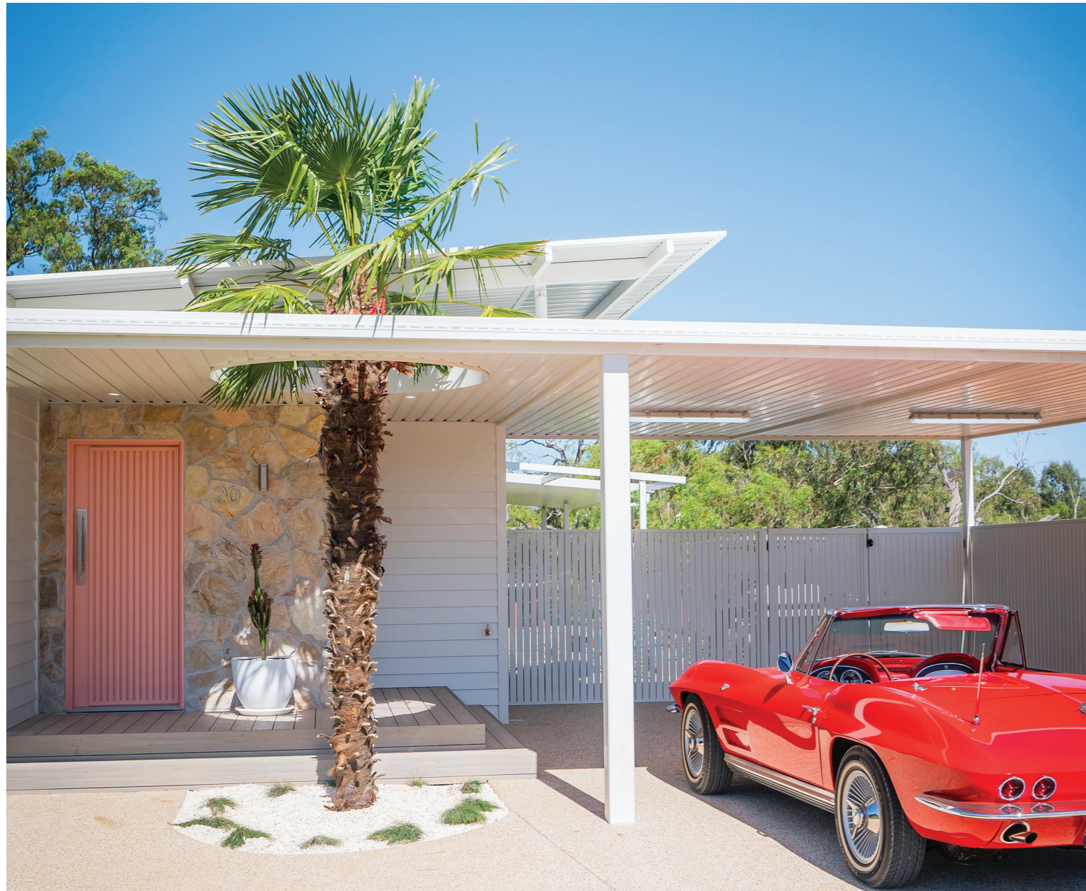
THIS PAGE - Splashes of subdued colour are added throughout using retro pastels. The pelican pink front door for example, is a soft, feminine choice iconic to the era.

include warm whites - crisp and clean for a classic backdrop; a warm, 'sun-kissed' tone known as Sherbet, and Terracotta - a salute to the Mallee desert.