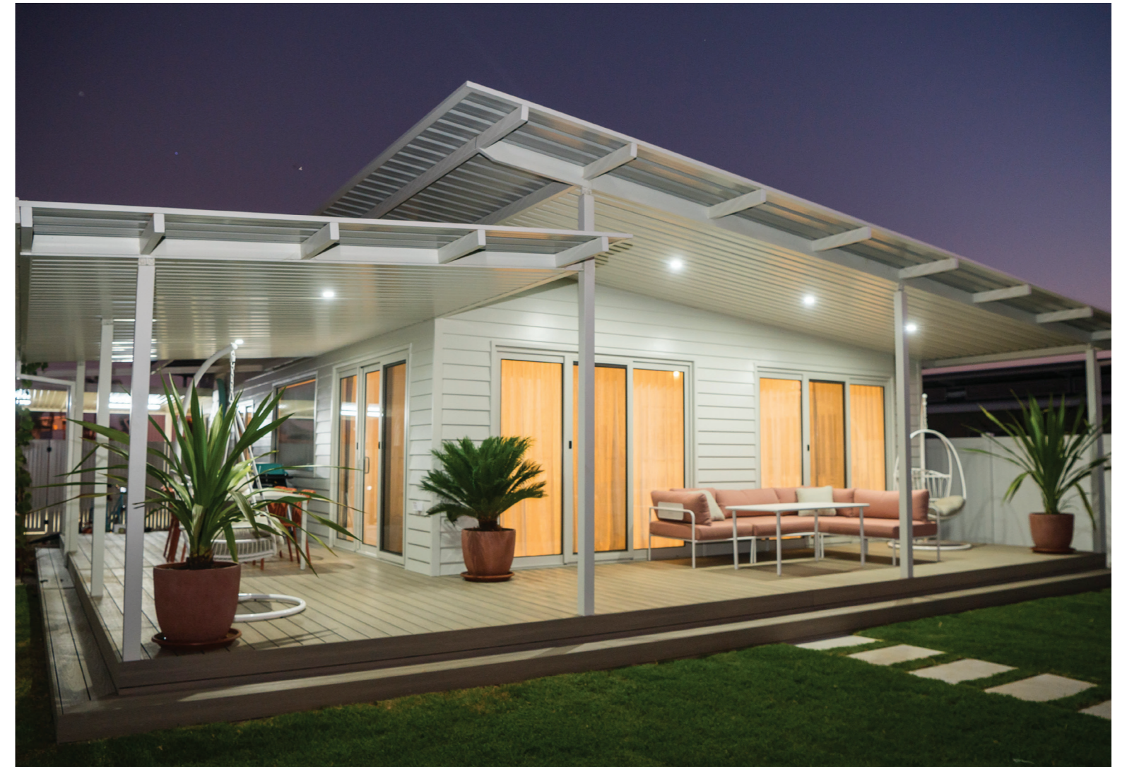
THIS PAGE & OPPOSITE - Known as 'The Bellevue,' this first home is one of a trio of Trentham Waters Living display homes to be constructed.